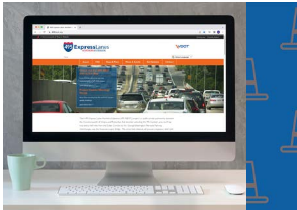
495NEXT.org Project Website