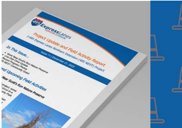
Newsletters & Weekly Lane Closure Reports