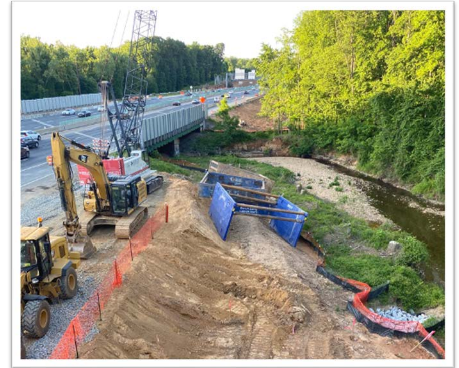
Looking north, piles will be driven for the future Old Dominion Drive bridge starting in mid June

Construction progress is subject to change due to weather and other factors