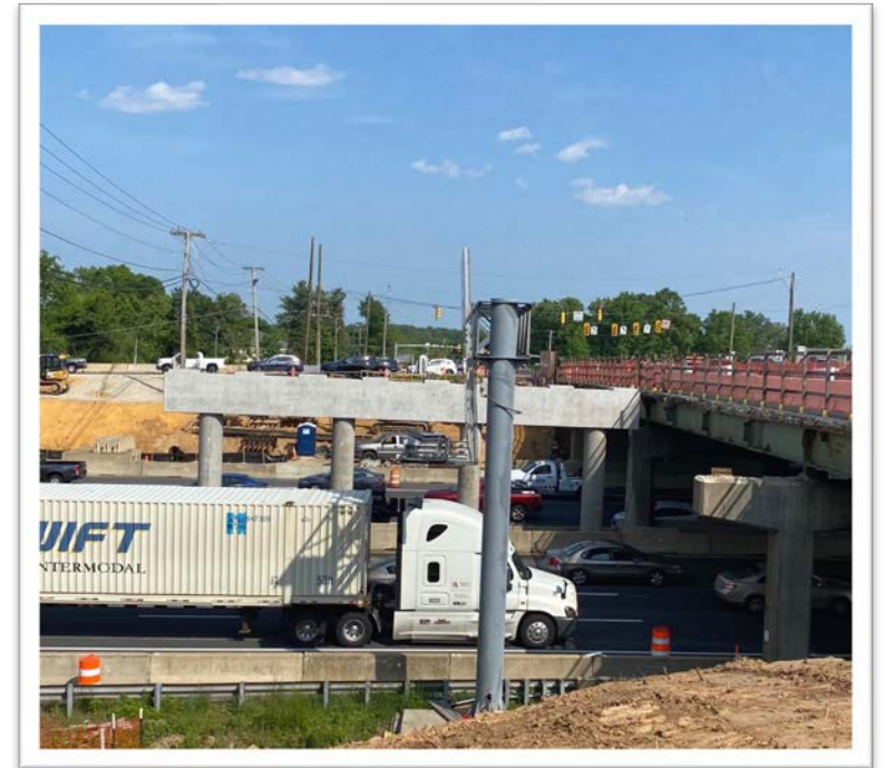
Looking east, future alignment of Georgetown Pike Bridge

Construction progress is subject to change due to weather and other factors