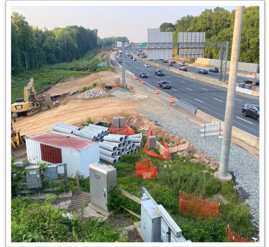
The footprint of the wider future Beltway as viewed from the Old Dominion Drive overpass looking north

Construction progress is subject to change due to weather and other factors