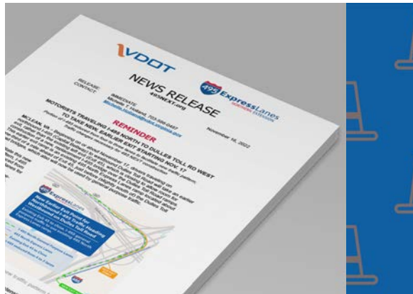
News Releases & Media Outreach