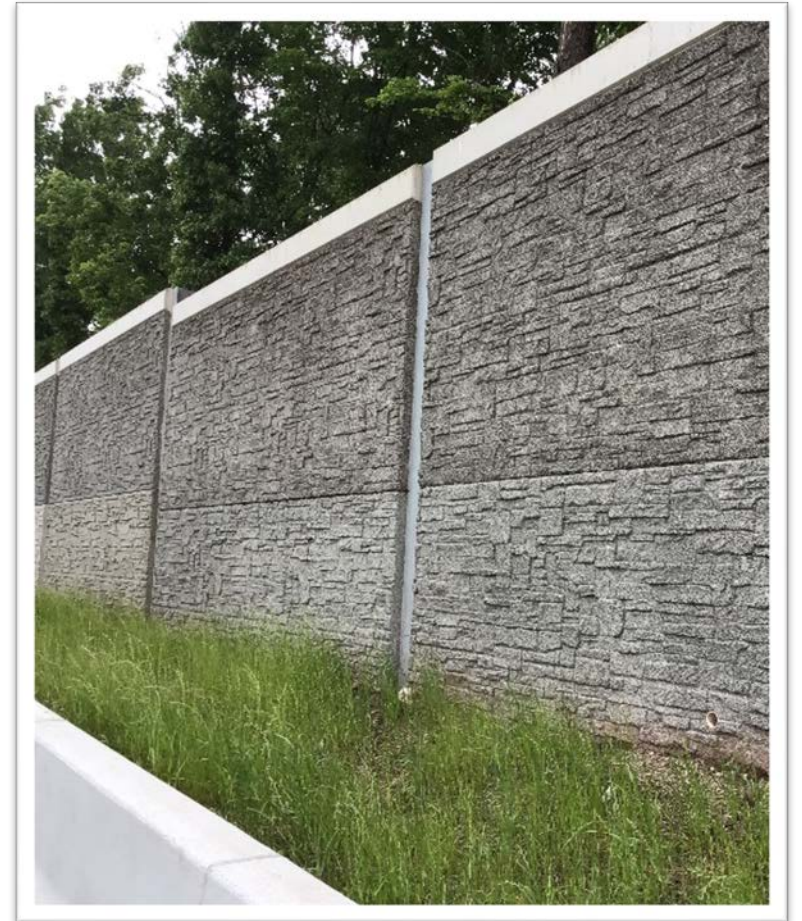
Example of dry stack (simulated stone) noise wall