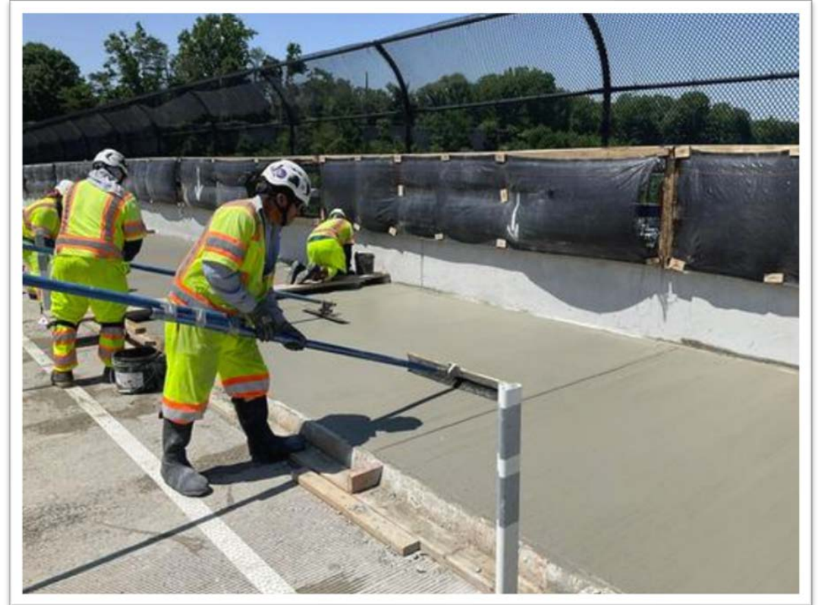
Workers finishing one side of sidewalk on the Lewinsville Road bridge

Construction progress is subject to change due to weather and other factors