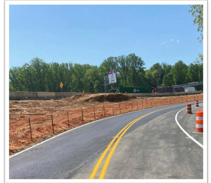
Looking south, new pavement for temporarily realigned Live Oak Drive is apparent on left

Construction progress is subject to change due to weather and other factors