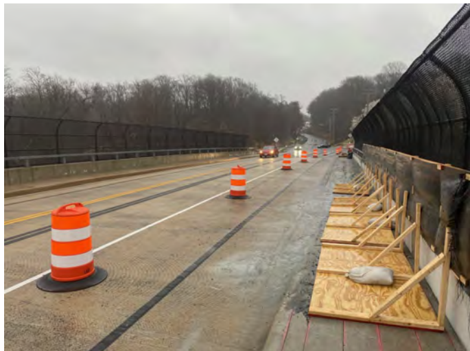
In progress sidewalk demolition. Five-foot-wide sidewalks on both sides are being replaced with 10-foot-wide sidewalks.

The previous five-foot-wide sidewalks on the Lewinsville Road Bridge are being replaced with 10-foot-wide sidewalks that will connect with the project's bicycle and pedestrian trail, which will run north along the entire length of the project.