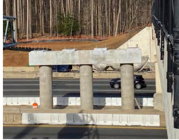
In February 2023, the center pier of the replacement Live Oak Drive Bridge was completed. Workers are now building the bridge abutments on both sides of the Beltway.

The periodically noisy work will involve driving steel piles into the earth. When active, neighbors may hear hammer strikes every few seconds. The pile driving, which typically takes a few weeks at each location, will occur during daytime hours, and noise levels will be monitored.