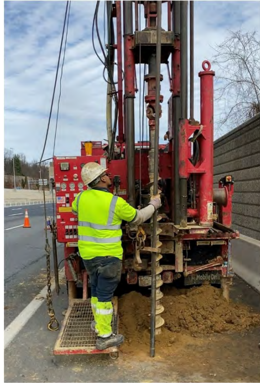
A boring rig operator monitors progress as the rig's auger drills down to retrieve soil samples.

Most of the remaining borings will occur along the Beltway. These boring operations require single-lane closures during daytime off-peak hours to provide a safety buffer between work crews and traffic.