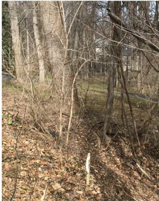
A stake marking the VDOT right-of-way line on Live Oak Drive

interpreted as indicating where project impacts may occur.