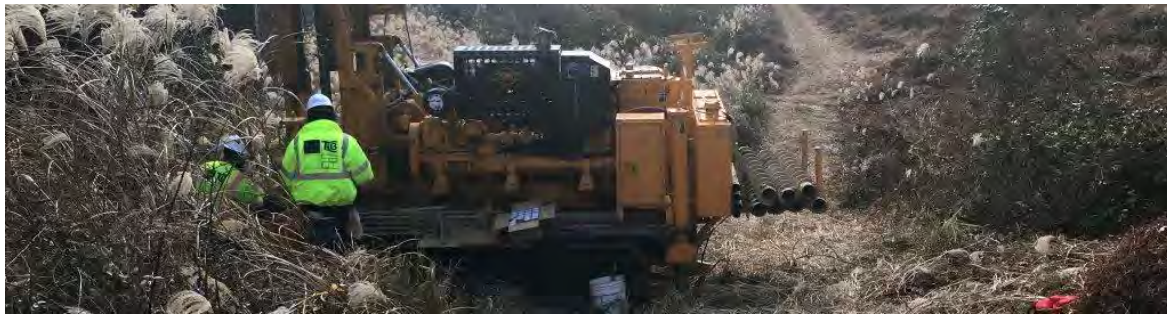
Boring rig in action

All construction-related activities are subject to change based on weather, contractor scheduling, and other factors.